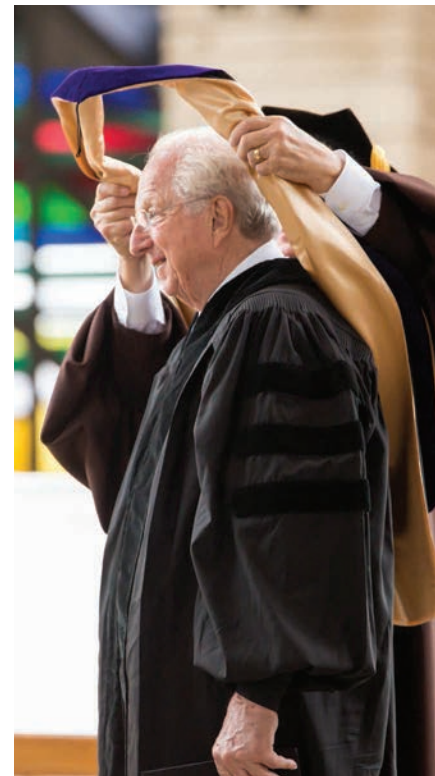
LORD HARRY WOOLF Lord Chief Justice of England and Wales, retired 2005.

The Honorable Lord Harry Woolf was the recipient of an honorary degree at the 2015 Valparaiso University Law School commencement ceremony, May 16, 2015. Lord Woolf, a distinguished advocate, judge, and public intellectual, has been a dedicated friend and supporter of Valparaiso University. He has hosted students participating in Valparaiso University Law School’s annual London and Cambridge summer program for many years, allowing students privileged access to the Royal Courts of Justice on the Strand, the Houses of Parliament, and the Supreme Court of the United Kingdom.