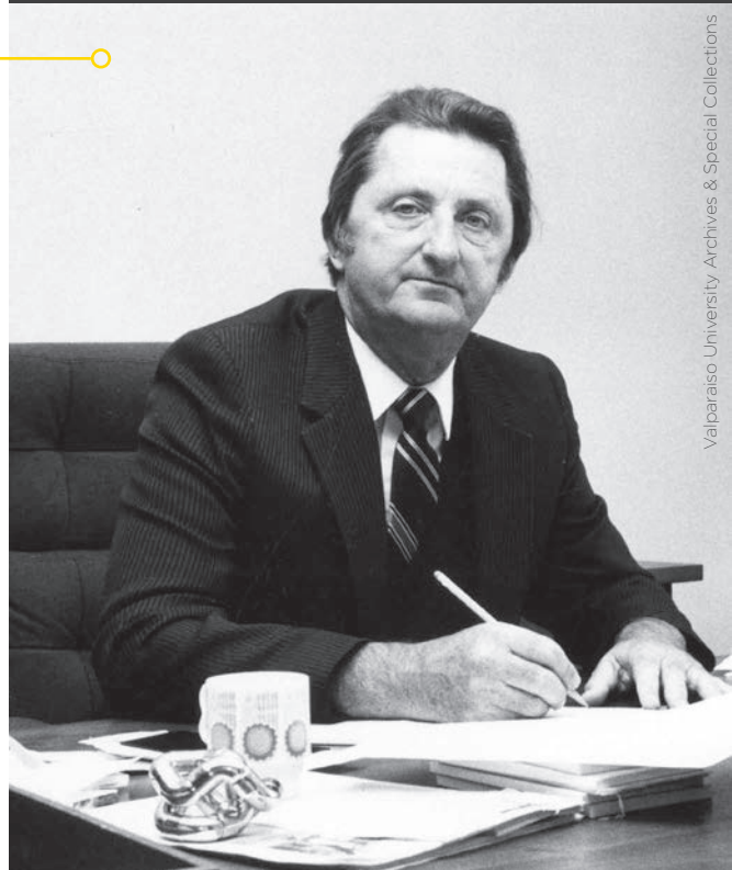
Valparaiso University Archives & Special Collections